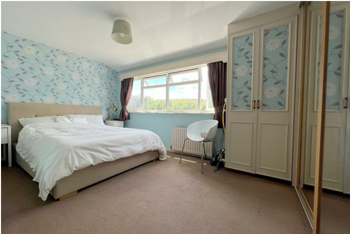
Council Tax Band: D